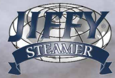
Worldwide Leader in Steaming Equipment Since 1940

the Jiffy® Steamer is filled with the promise and desire to harness the power and magic of steam.